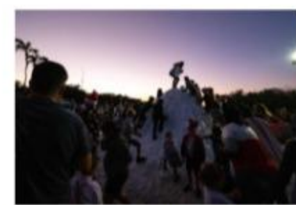
IN PICTURES: SNOW MOUND AND PARADE EXCITE HOLIDAY FEST GOERS IN ISLAMORADA