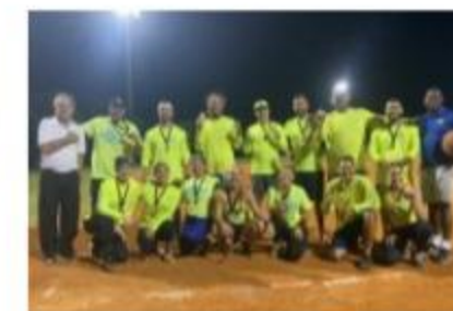
KICKBALL TEAM GOES UNDEFEATED IN ISLAMORADA LEAGUE