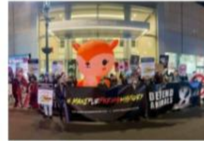
FROM THE FAMOUS FOX: RAISING AWARENESS OVER FUR ON BLACK FRIDAY