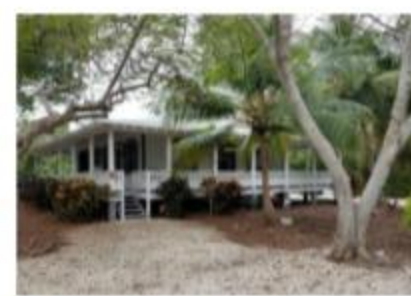
ENVIRONMENTAL ADVOCACY GROUP OPENS NEW CENTER IN ISLAMORADA