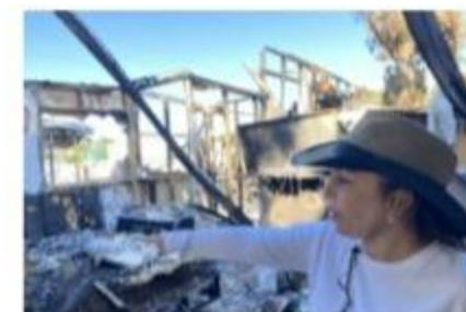
'BEYOND THE FIRE THERE IS HOPE': KEY LARGO RALLIES BEHIND GRANDPARENTS WHO LOST HOME