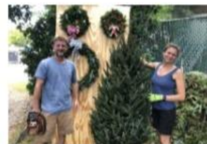
ISLAMORADA'S TRADING POST XMAS TREE FAMILY IS NOT COMING THIS YEAR...DON'T WORRY, THEY'RE OKAY!