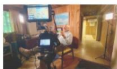
LEGENDS OF BACKCOUNTRY FISHING FEATURED IN NEW FILM March 26, 2021