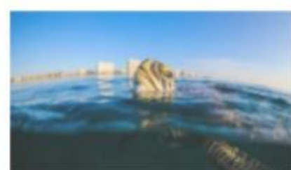
'TROUBLED WATERS' August 12, 2019

If you would like to have the Weekly delivered to your mailbox or inbox along with our daily news blast, please subscribe here.