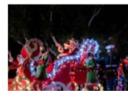
SAVE THE DATE: UPPER KEYS 2021 HOLIDAY EVENTS