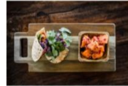
FLORIDA KEYS TABLE: FOOD, DRINKS & PEOPLE