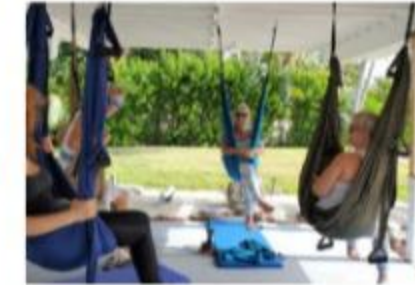
LOCAL INSTRUCTOR INTRODUCES AERIAL YOGA TO THE UPPER KEYS