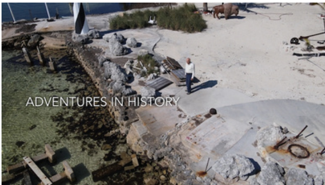
Opening credits for Adventures in History