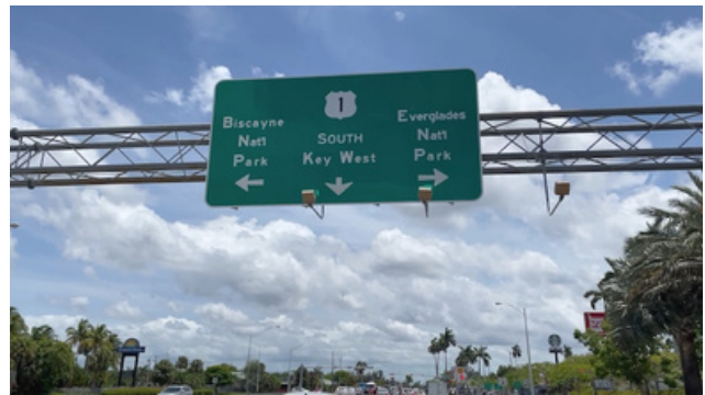
En route to the Florida Keys