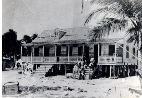
Early settlers in the Florida Keys